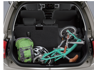
Rear seat split folded.