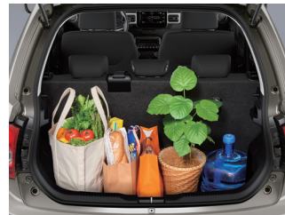
Rear seats raised.