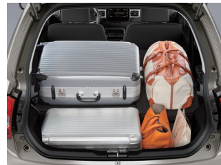
Both rear seats folded.